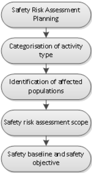
Figure 2.1N Safety risk assessment planning process

2.2 The tasks required to carry out the safety risk assessment using the framework safety risk assessment process presented in Appendix A shall be defined before beginning a safety risk assessment.