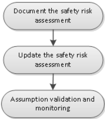
Figure 4.1N Document and maintain safety risk assessment process

4.2 All steps of the safety risk assessment shall be documented.