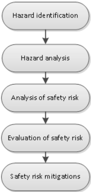
Figure 3.1N Safety risk assessment

3.2 All reasonably foreseeable hazards associated with an activity shall be identified.