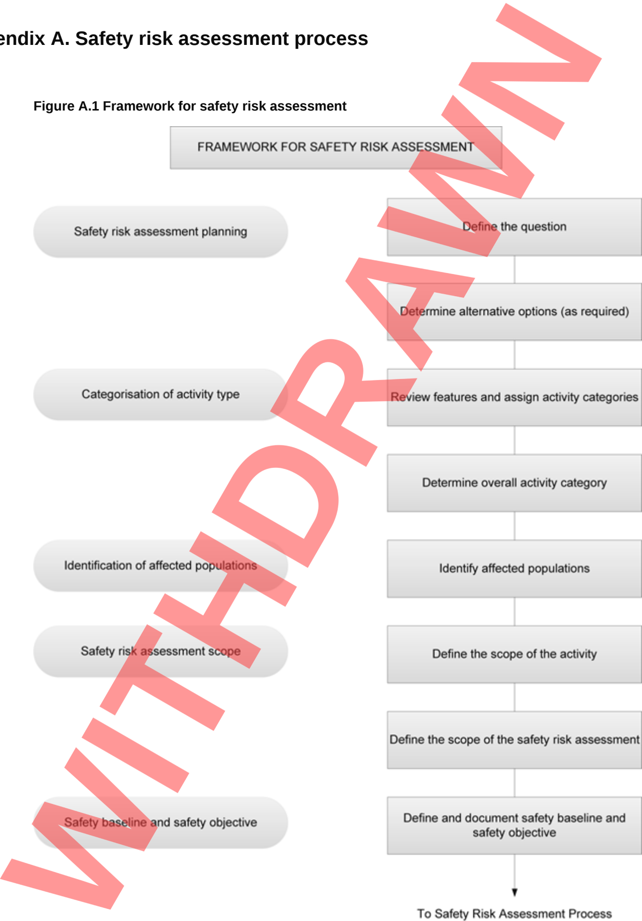
Figure A.1 Framework for safety risk assessment