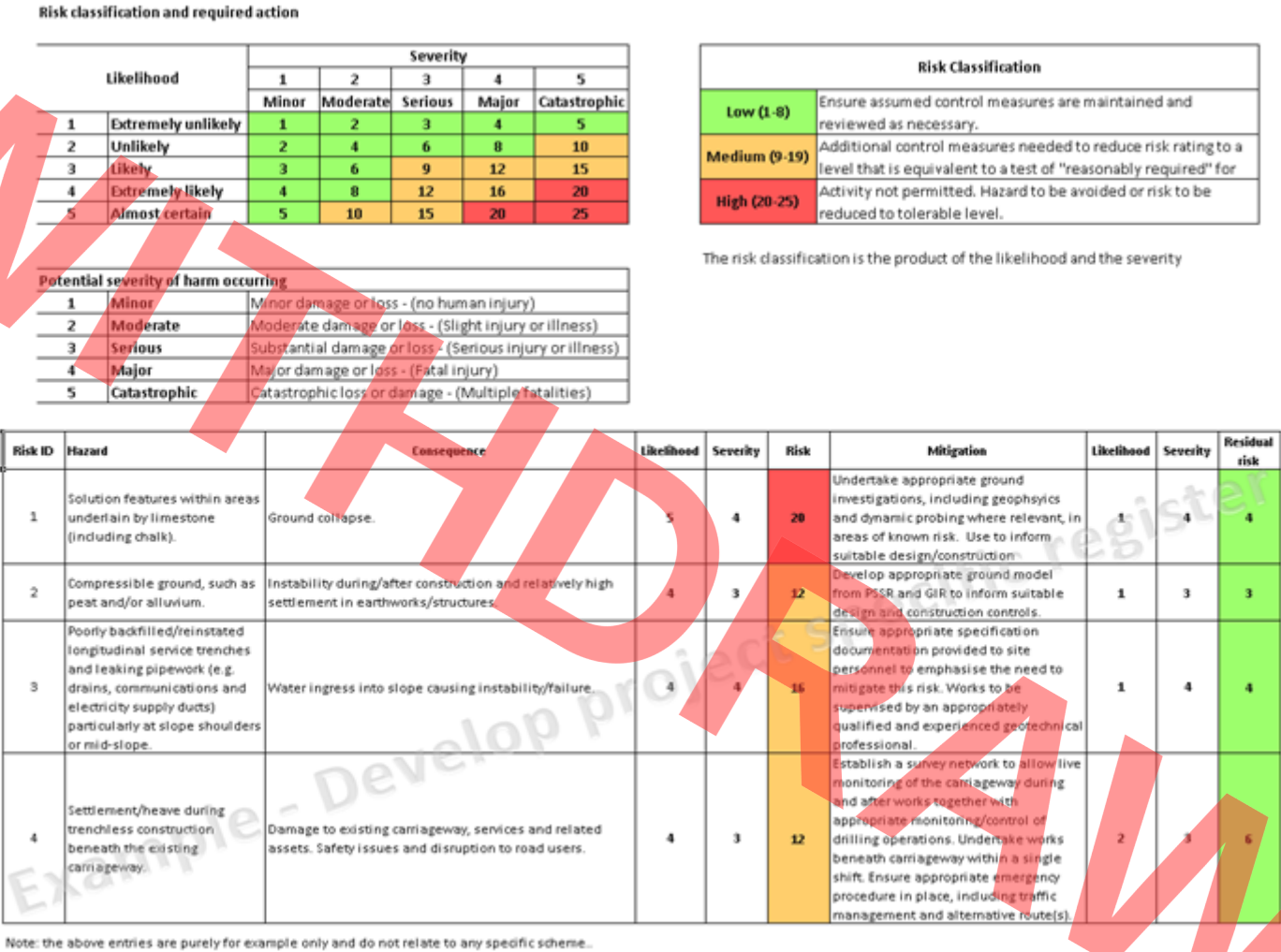
Figure B.1 Example of a geotechnical risk register