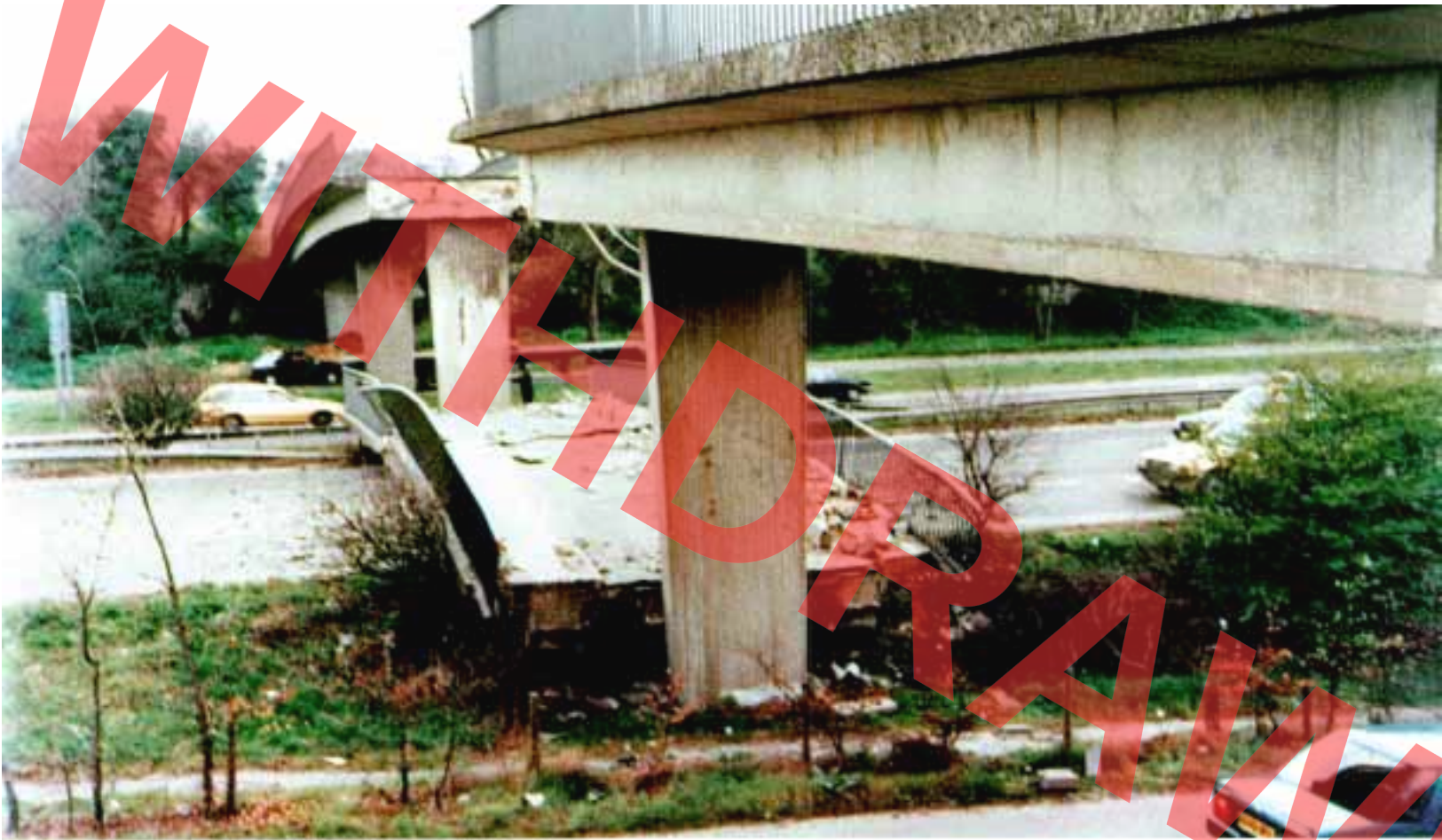
PLATE 2 COLLAPSE OF A DECK SPAN FOLLOWING A COLLISION FROM AN EXCAVATOR TRANSPORTED ON A LOW LOADER A2 PARK PALE ACCOMMODATION BRIDGE