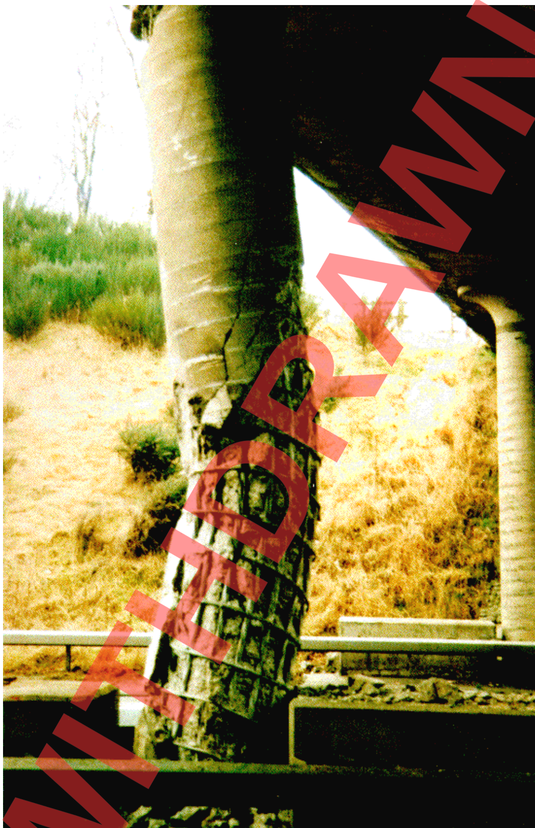
PLATE 3 COLLISION DAMAGE TO REINFORCED CONCRETE CENTRAL SUPPORT M74 LAIRS FLYOVER - B7078