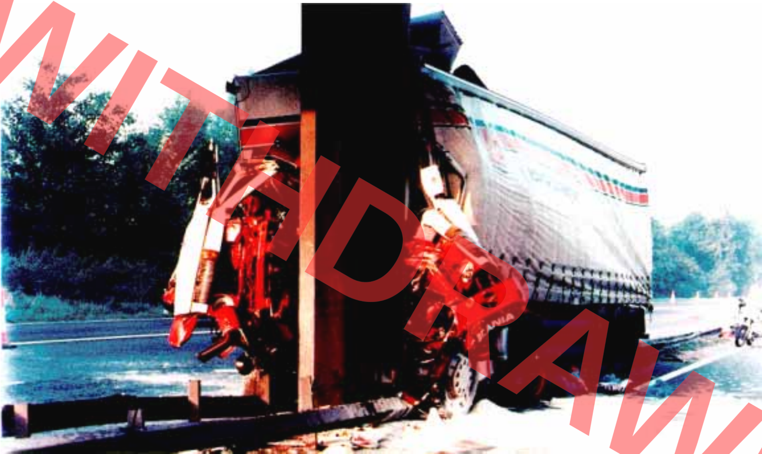
PLATE 1 COLLISION OF HGV WITH REINFORCED CONCRETE SUPPORT M20 BOXLEY ROAD BRIDGE