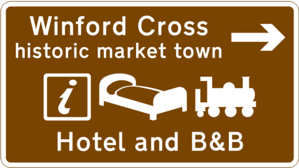
Figure E/6.1.1 Example of a bypassed community sign