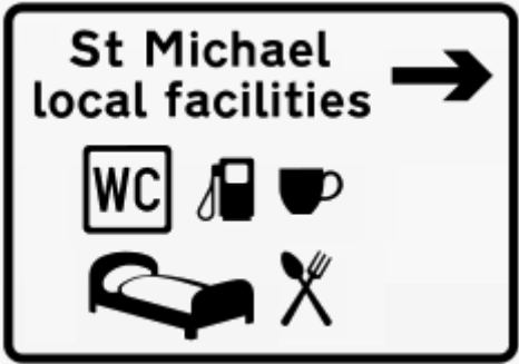
Figure E/6.5N Example of a local facilities sign