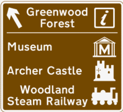
Figure E/3.4N2 Example of collective tourist signing