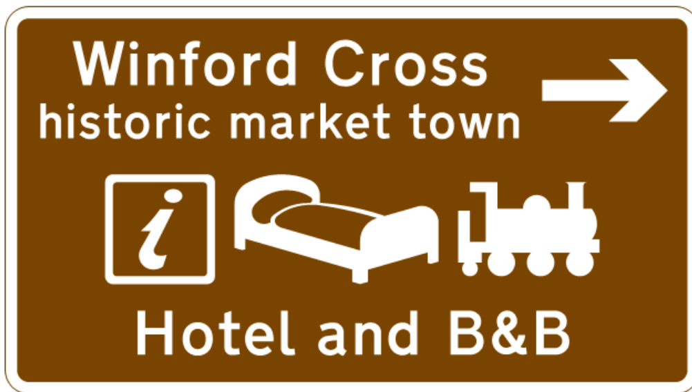
Figure E/6.1.1 Example of a bypassed community sign

E/6.2 Bypassed community signs shall not be permitted for a community that is already signed from an all-purpose trunk road.