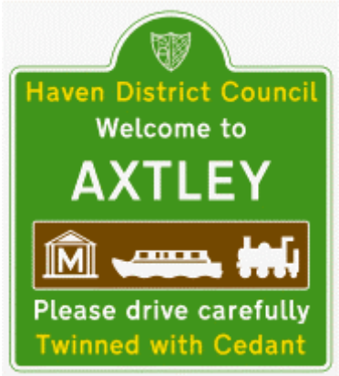
Figure E/4.5N Example of a town or village boundary sign with tourism information