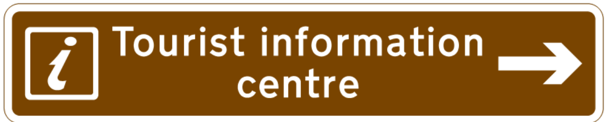
Figure E/5.3 Example of a tourist information centre sign

E/5.3 Where prescribed by TSRGD SI2016 No.362 [Ref 7.N] initial signs to TICs shall display the legend 'Tourist information centre' and the associated "i" symbol as shown in Figure E/5.3.