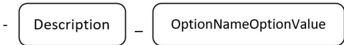
Figure 4.11 Options appended to description