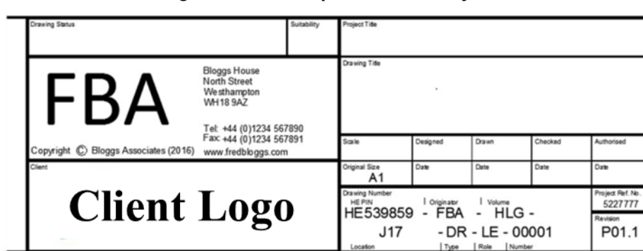
Figure 4.36.1 Sample title block layout

4.36.1 Title blocks should follow the example layout shown in Figure 4.36.1.